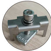
Dispatched with Module